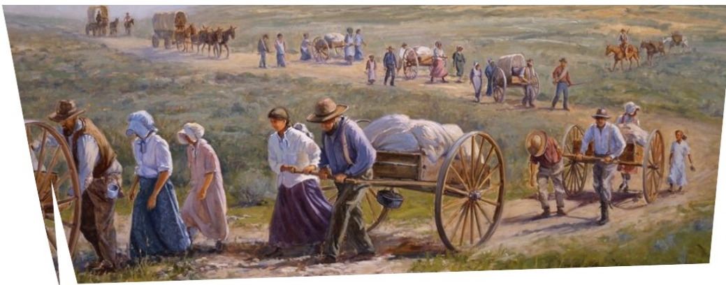
THE MORMON TRAIL THROUGH MACEDONIA NOVEMBER 21, 5:30 PM PIONEER TRAIL MUSEUM

Plan to attend this fun & informative program, Thursday, November 21, at 5:30 at the Pioneer Trail Museum. Suggested donation is $5 and is free for everyone 80+ years of age. Refreshments will be served!