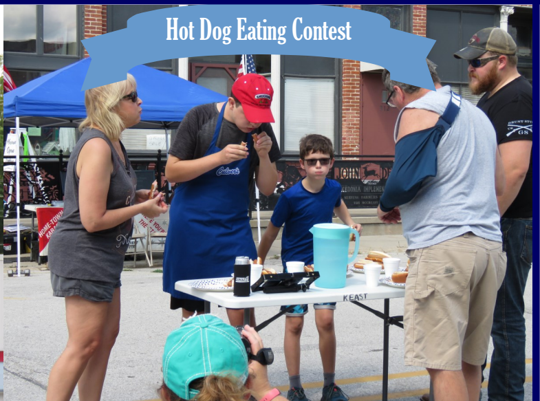
Hot Dog Eating Contest