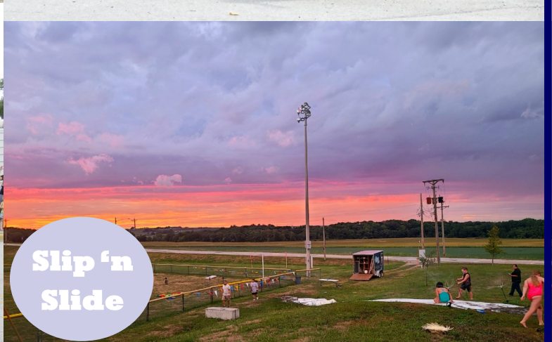
Slip 'n Slide